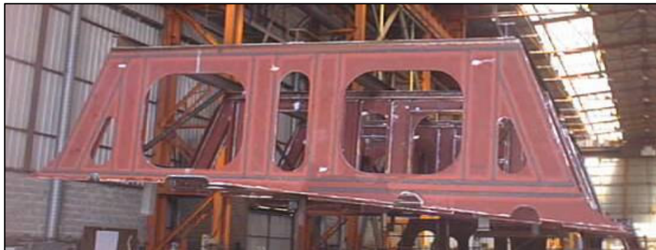
NAVION ANGLIA VOC seating