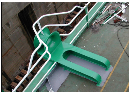
LNG DELTA Fairlead