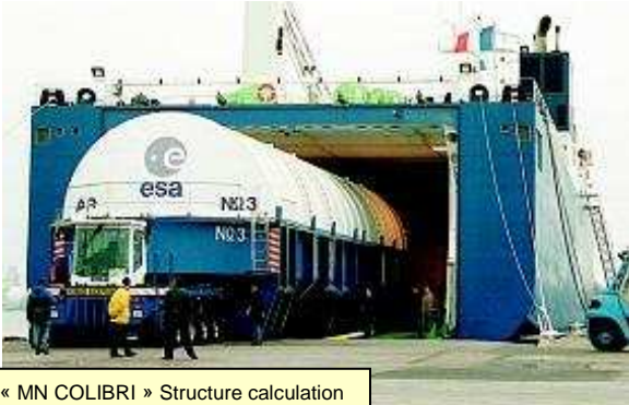
« MN COLIBRI » Structure calculation