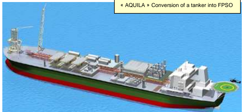
« AQUILA » Conversion of a tanker into FPSO