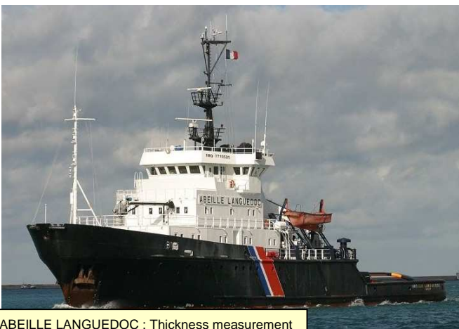
ABEILLE LANGUEDOC : Thickness measurement